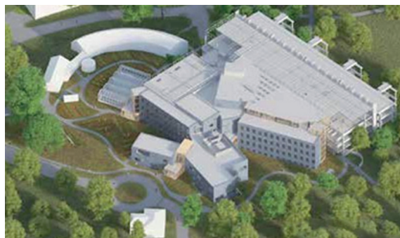
The Wellesley College Science Complex

When revisiting their strategy, the college discovered that the lab's air exhaust system was the main culprit. While many technologies were chosen to help achieve ZNE, the filtered fume hoods were vital to this goal. These hoods allowed for numerous energy conservation and cost-saving measures, including a reduction in air exchange rates, which for Bristol meant that the required air intake was reduced by two-thirds. This approach also made it feasible to implement enthalpy wheel heat recovery systems , which are highly efficient in capturing and reusing heat from exhausted air. These systems are rarely used in traditional lab designs due to the risk of contaminating the fresh air supply.